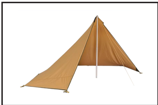
Canopy 5/7 put up as a wind-break

Putting up the canopy as a wind-break or freestanding shelter