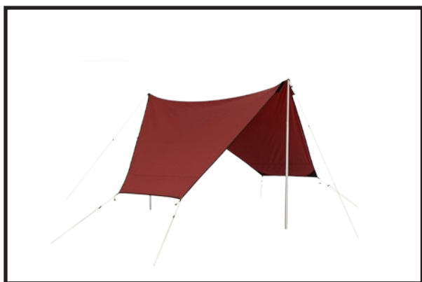
Canopy 5/7, lightweight model, put up as a freestanding shelter

First of all, put a tent peg in the band loop on the side opposite the side with the Velcro fastening. Push the end of a telescope pole through the eyelet by the Velcro fastening and adjust it to a suitable height. Peg the cord down and tighten it. Place tent pegs along the long sides. Canopy 5/7 has band loops for two tent pegs on each side while Canopy 7/9 has band loops for three tent pegs on each side.