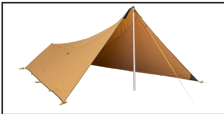
Canopy 7/9 put up as a wind-break