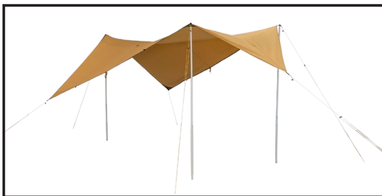
Canopy 7/9 put up as a freestanding shelter